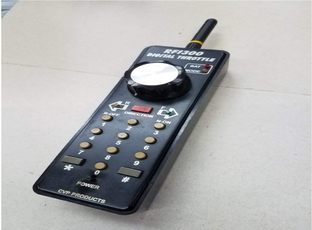
Airwire RF1300 Throttle

He said that unlike the early RF1300 throttles, the T5000 does not have a voltage regulator, and is very sensitive to overvoltage.