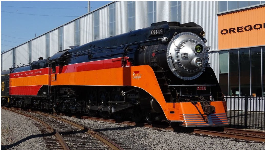
Here comes the Daylight, to take us to the barbeque.