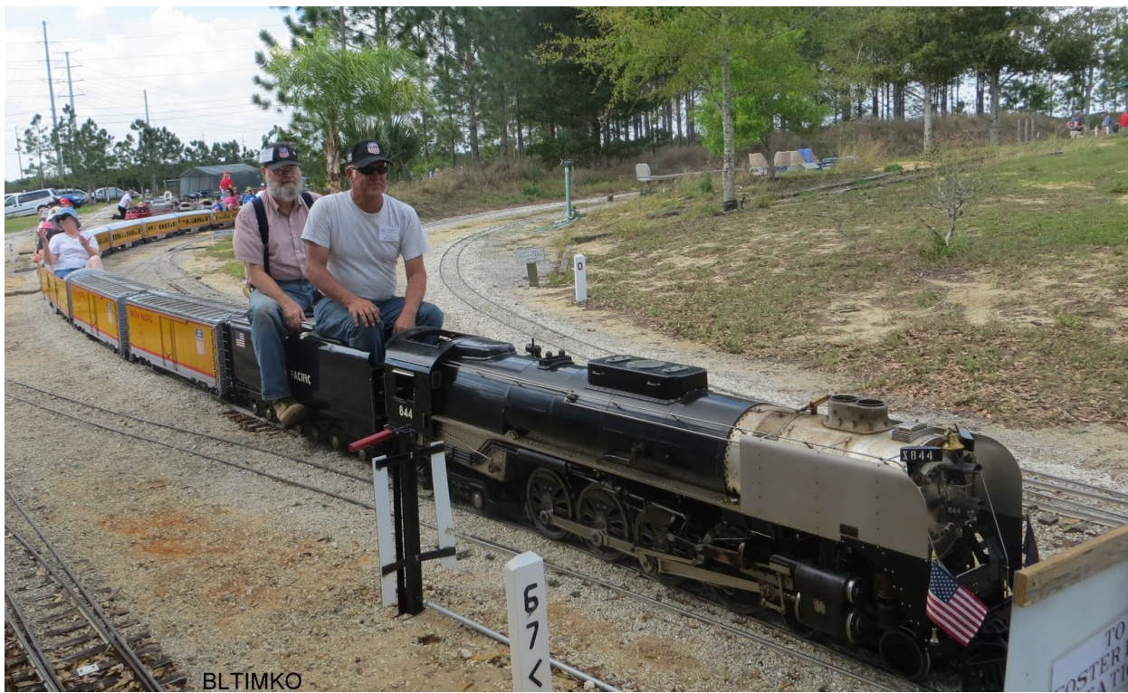
A live steam UP #844 pulls a long train carrying guests

If you have been here before, you will notice that the "G" gauge area has recently seen some very nice additions and improvements. Originally there was one covered area. Now there are two! The new covered area is a great addition. In the pictures you can see the new bench work and details.