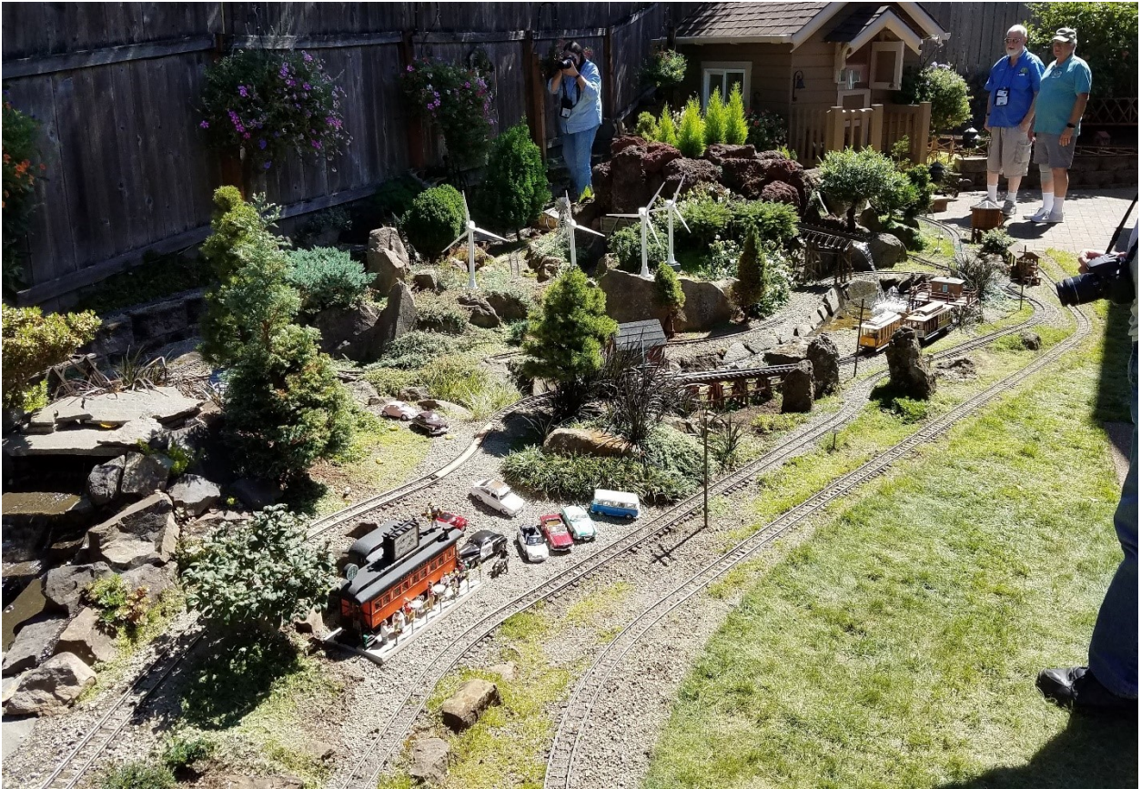
And many fine little backyard layouts, like this one, complete with operating wind generators.